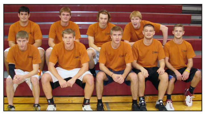
Class of 2007 - Maroon Division champions

There were a couple of social gatherings during the tournament. Alumni gathered at Glur's Tavern to watch the UNL versus Colorado football game after the first round of games on