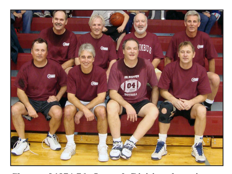
Classes of 1974-76 - Legends Division champions

Friday, and a post tournament gathering was well attended at the Elks Country Club on Saturday night.