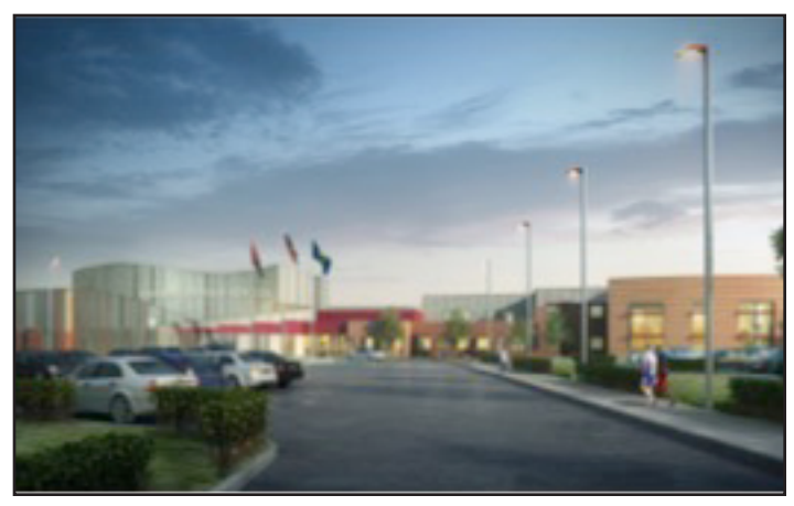
DRIVING IN - Drawing of the new entrance to the high school.