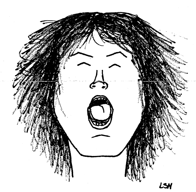
For those about to Rockercise ...

At the beginning of the record, a nice, mellow voice quietly said,