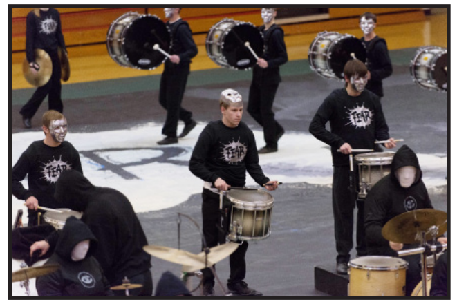
WINNING PERFORMANCE - The CHS Winter Percussion Ensemble competing at the Heartland Winter Arts Alliance Championship.

"I didn't want to do it that first year," he said. "I made it as difficult as possible."